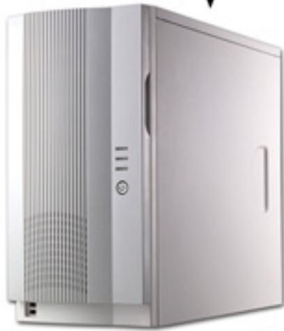
Shared dictation directory on your network server

When On-the-Go dictation is needed, the Olympus DS-4000 digital portable is easy and convenient to use. The hassle of having to carry around and give tapes to your secretary is a woe of the past. Simply plug your portable via USB to any networked PC and your dictation files are ready for transcription.