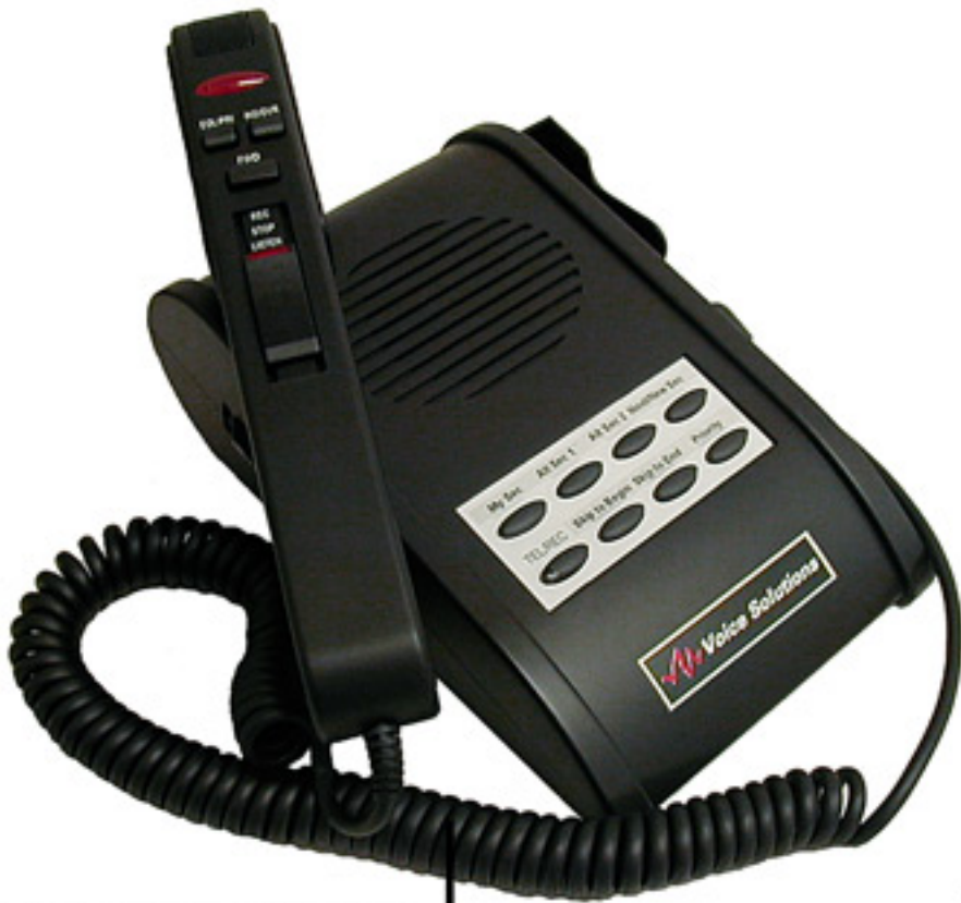
PC Dictate Station

Using PC Dictate is easy; just log into the computer application and start dictating. The familiar hand held microphone gives you control over your dictation from start to finish. What's the digital difference? When you start your next dictation, the first one is already on its way across the network to your assistant for immediate action. One-touch control buttons on the desktop station make choosing a new secretary, or saving a job for completion later, a breeze.